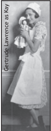
Gertrude Lawrence as Kay

THANK YOU FOR TURNING OFF ALL CELL PHONES, PAGERS, & WATCH ALARMS DURING THE SHOW!