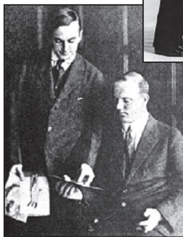
Above left: Ira Gershwin