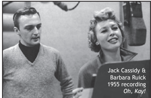
Jack Cassidy & Barbara Ruick 1955 recording Oh, Kay!