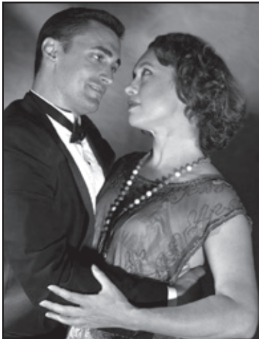
above & below: Oh, Kay! at 42nd Street Moon, 2011