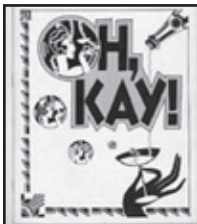
Clockwise from top: 1926, 1978, & 1990 program covers